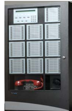
E3 Series Broadband